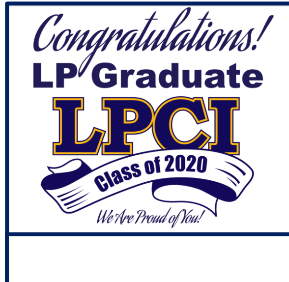
LAWN SIGN FOR ALL GRADS